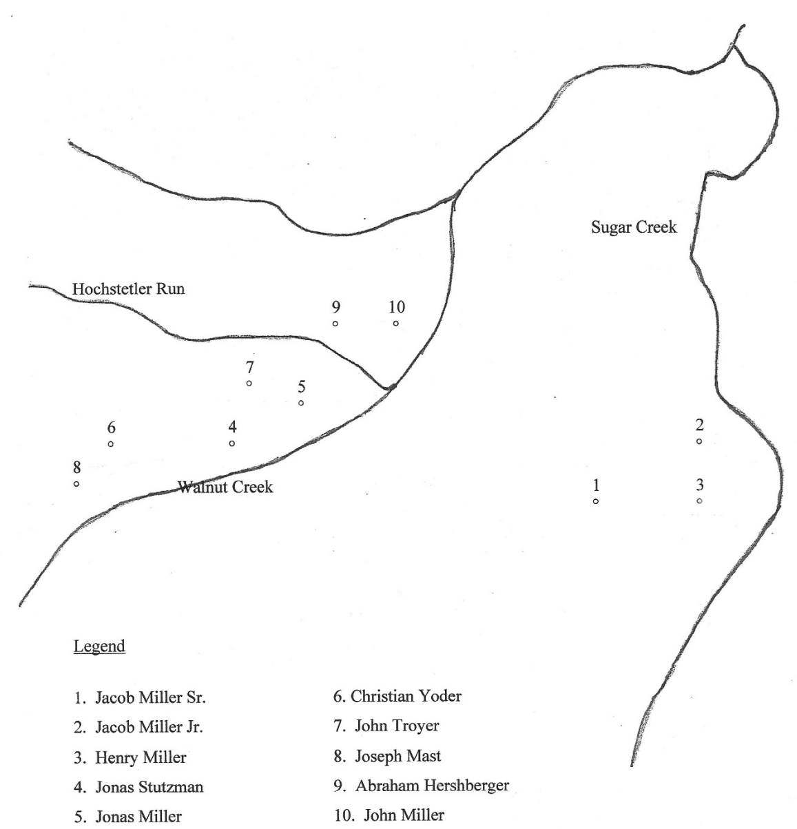
Figure 1 First Ten Households, 1809–1810

What led them to the Sugar and Walnut Creek valleys is a mystery today. There is no archival material that indicates their preference for this area, nor any previous connections to this land that are obvious. While purely conjecture, it is possible that Andrew Ellicot, one of the initial surveyors of this land, may have had contact with the Amish when he led a survey that extended the Mason-Dixon Line through the Somerset community. <sup>20</sup> The network of trails by the previous occupants of the land played a role in their selection as well. New Philadelphia had the first ferry crossing south of Ft. Laurens and the Greenville Treaty Line. The valley of the Sugar Creek is the second